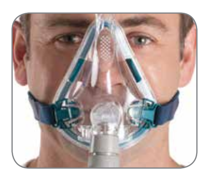
Mirage Quattro sits around the point of the deepest depression at the top of the nose (the sellion).

Both Quattro Air and Quattro FX<sup>™</sup> sit lower on the nasal bridge than Mirage Quattro. This improves the patient's vision, and shifts the sealing area away from the sensitive area at the tip of the nasal bridge.